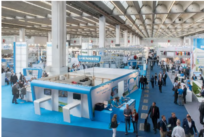
Texcare 2024 highlights the top themes of automation, the circular economy, energy efficiency and hygiene.

You can find the top themes on the web here .