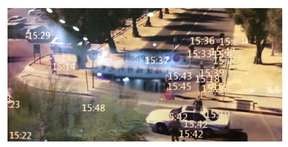
Exhibitors of the Secutech Taipei security fair show software that analyses videos and affixes smart tags to relevant elements.

Thus, passive security and market research become a single entity if necessary – a milestone from the user's point of view because security now has the potential to change from being a pure cost centre to a profit centre. By, for example, processing all the data collected.