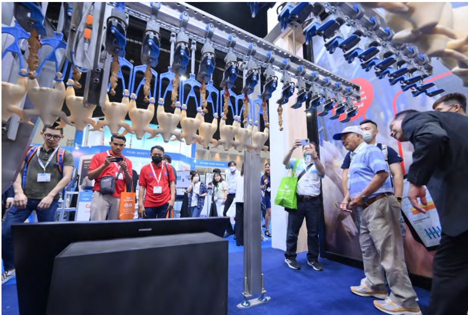
Participants converse at Meat Pro Asia 2023

A strong turnout of trade visitors from across the ASEAN region has confirmed Meat Pro Asia as an essential new addition to the meat and food processing and packaging event calendar. Despite being a new player in the industry, the fair was lauded for attracting top-quality participants, with exhibitors in particular noting the high calibre of buyers and the clear potential for the fair to grow at future editions. Closing its doors on 10 March, the three days fair drew 8,894 visitors from 89 countries worldwide to source from over 100 exhibitors.