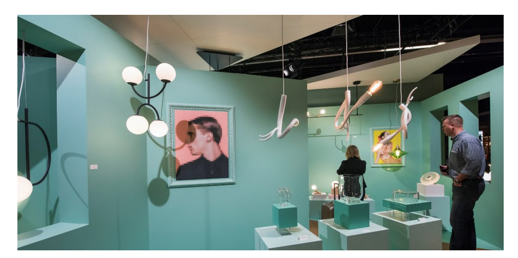
The Light + Building Trend Forum is the visionary starting point for all design-oriented designers.

It comes as no surprise then that topics such as holistic thinking, future products and recycling are omnipresent in all areas of design. These can also be clearly seen in lighting design, but new materials and innovative processing techniques are often needed to implement these aims. In this respect, working materials that are either particularly durable or that can be easily returned to the resource cycle are also experiencing a renaissance. Stone is an example of this, as are wood and metal. In addition, designers like to work with alternative raw materials, such as bioplastics. Another trend: digital technology is increasingly meeting the needs of modern users as the centrepiece of modern lighting design – even if light fixtures are kept classic in style. This is made possible with ever more delicate and powerful LED and OLED lights.