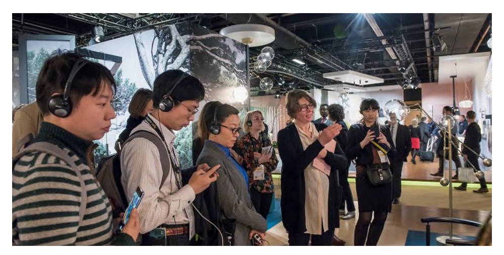
Three scenarios for the ears – the Light + Building Trend Forum audio guide explains the background behind the impressions.

trends in three scenarios – 'Organic Sculptures', 'Studied Masterpieces' and 'Inventive Collages'. These are being researched and put together by the prestigious Stilbüro bora.herke.palmisano.