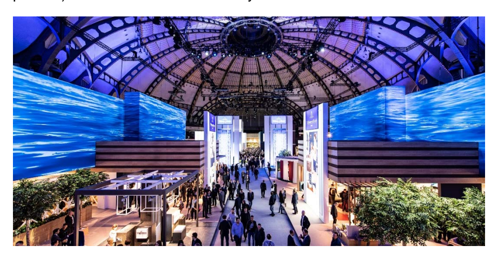
ISH, the world's leading trade fair for HVAC + Water, presented progressive building-services technology to visitors from 161 nations.

From 11 to 15 March, around 190,000 visitors (2017: 198,810*) from 161 countries (2017: 153) made their way to Frankfurt Fair and Exhibition Centre to discover the latest innovations and trends at ISH 2019. For five days, 2,532 exhibitors (868 from Germany, 1,664 from abroad) from 57 countries presented their new products for the first time in Frankfurt am Main. At the same time, a significantly higher level of internationality meant that ISH became even more relevant: 66 percent of exhibitors (2017: 64 percent) and almost 48 percent of visitors (2017: around 40 percent) came from outside Germany.