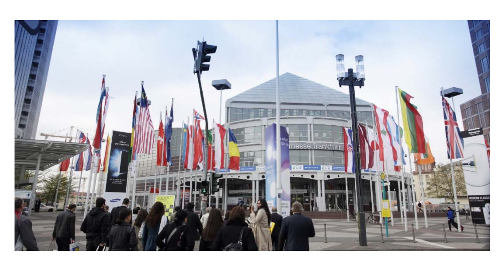
In 2019, France is the Partner Country of ISH – the world's leading trade fair for HVAC + Water – in Frankfurt am Main

The aim of the concept is to create an international forum for important subjects relating to energy and innovative building-services technology with contributions being made to this by, for example, the German-French Forum on the second day of the fair (12 March 2019).