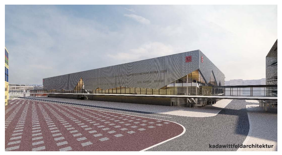
The new Exhibition Hall 12 will be used for IFFA 2019 for the first time