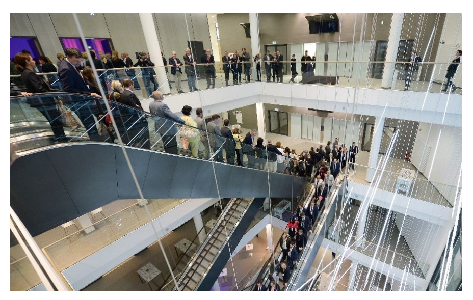
E2 Forum Frankfurt 2018 focuses on the vertical-horizontal mobility in the buildings of tomorrow

Against the background of the Frankfurt skyline, on 18 and 19 September 2018 around 300 experts will gather in the Forum on the Messe Frankfurt exhibition grounds for a dialogue between developers and manufacturers from the elevator and escalator industry and decision-makers from building technology, plant engineering and architecture as well as operators from the real estate sector. The E2 Forum Frankfurt programme, which is organised by Messe Frankfurt in cooperation with the VDMA trade association Elevators and Escalators, consists of a specialist conference and accompanying exhibition.