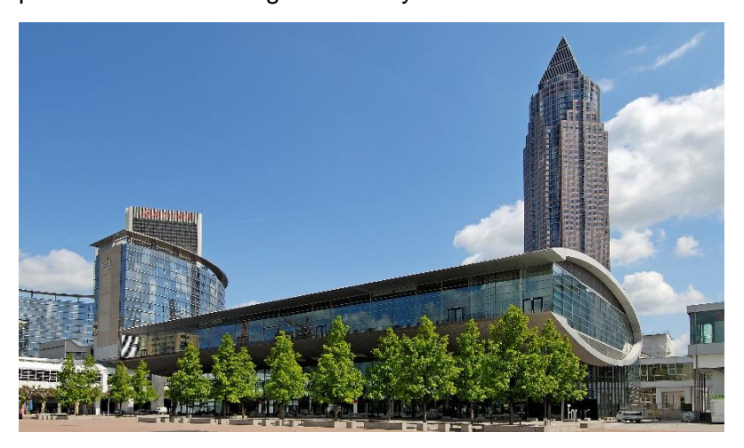
Forum.1 on the Frankfurt Fair and Exhibition Centre: venue for the E2 Forum Frankfurt 2018

The lectures, of which there are around 30, will look, however, at planning aspects such as concrete recommendations to use software for building information modeling (BIM), the interface with and demarcation from building regulations, elevator standards in building planning, factors influencing fire protection concepts and additional standards and regulations along with the responsibilities, duties and test procedures prior to commissioning elevator systems.